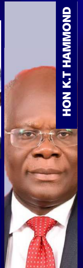
HON K.T HAMMOND