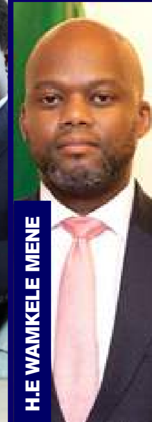
H.E WAMKELE MENE